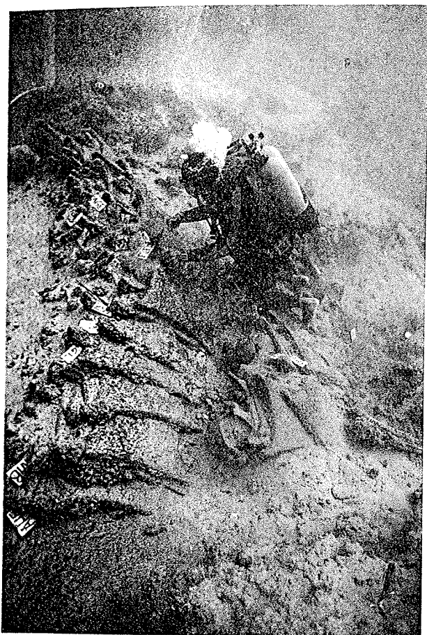
A nautical archaeologist attempts to excavate copper ingots from a Late Bronze Age shipwreck near Uluburun, Turkey; analysis of such artifacts may provide clues about the sailors' diet, the trade route used, the crew size, and a dating for the wreck.

the Canaanites, the early Phoenicians. In the fifteenth-century tomb of Nebamun at Thebes, a bearded Syrian had just arrived by ship with a cargo that included copper ingots and Canaanite amphoras. The ship itself is poorly preserved, but we can make out a down-curving upper yard and a wicker fence above the cap rail to keep out waves.